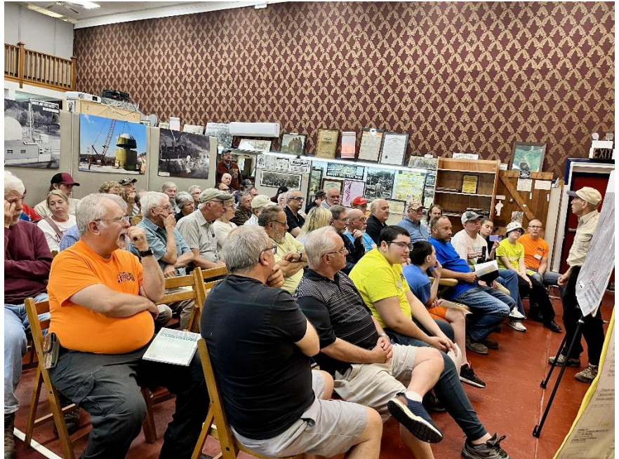
Above: The crowd at the geologic talk hosted at the Miners Museum included the Young Easties.