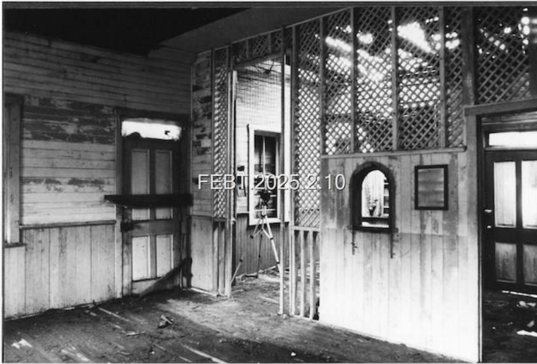
An interior view of the original Saltillo Station in its final years.