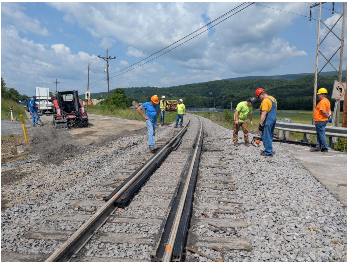
The FEBT and EBTF track crews install the rubber channel on either side of the rails on June 10, 2025 as the March to Saltillo pushes progress across the Pogue Road crossing below Jordan Summit near Southern Huntingdon HS. With the crossing now in operation again, there are only 1,800' of track restoration to reach Pogue Bridge.