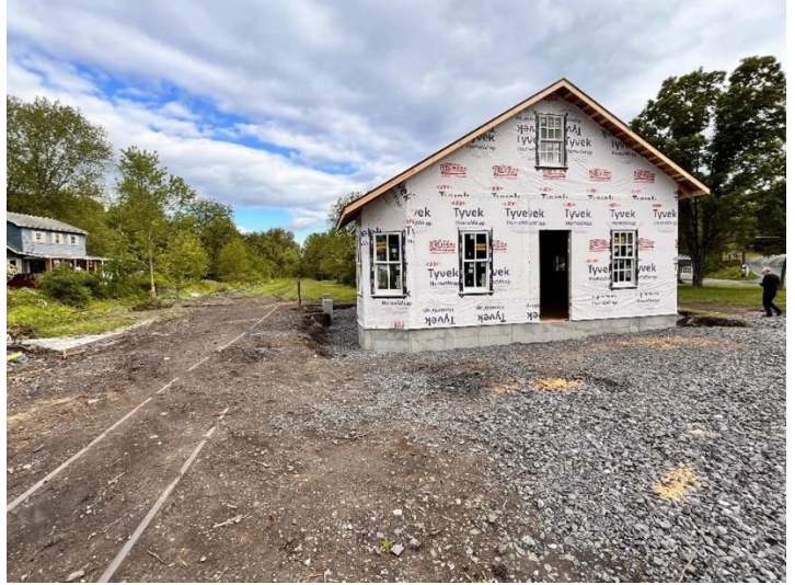
Comparison views of Saltillo Station from September 2023 and June 2025.

Saltillo Station continued to rapidly take shape this month. The chimney was installed using reclaimed brick. The new freight and agent's doors were installed, the train order signal post was installed, and the roof shingles were completed. In addition to this work by J.L. Swope Construction, volunteers in Rockhill sorted and inventoried the salvaged materials from the original station. FEBT volunteers will install many of these items during the completion of the interior. Your ongoing financial support will allow us to purchase the required materials to complete the project.