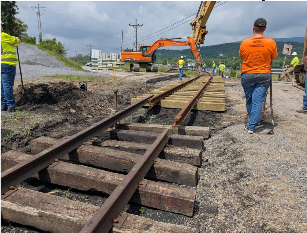
The track panel is lifted into place at the Route 994 crossing on June 9, 2025.

As was the case with the two grade crossings above, the Route 994 crossing was also fitted out with a pre-built panel track. Since this grade crossing is so long (almost 80 feet), two lengths of 100-pound rail were used. To eliminate the need for a joint in the crossing, the two lengths of rail were welded together. Then, a panel track was constructed.