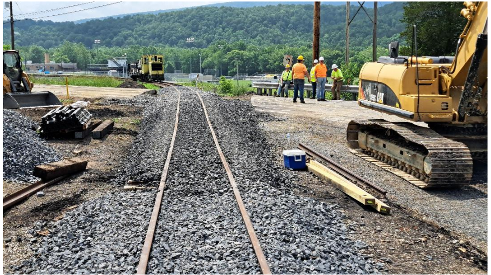
Above: The first work train has crossed 994 on June 10, as the track panel awaits tamping of its ballast.

driveways in front of the high school. Prior to the start of this construction, the old rail (# 85) will need to be removed. Then, the right-of-way can be graded in advance of the reconstruction, which will make use of # 100 rail. Plans at this point call for building through the two driveways (no advance construction of panel tracks). Once the northern-most driveway is done, it will be made temporarily passable so that school traffic can get into and out of the school complex. Once the southern-most driveway has been redone, both crossings will then be paved, in much the same manner as the two crossings north of Orbisonia were done. This work will bring the reconstruction to a point a short distance north of the Pogue bridge.