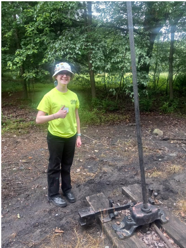
Left: A Young Eastie celebrates successfully throwing a switch in the Robertsdale Yard.