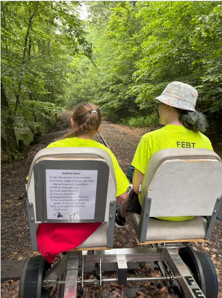
A pair of female Young Easties enjoys a railbike ride towards Wood on June 14.