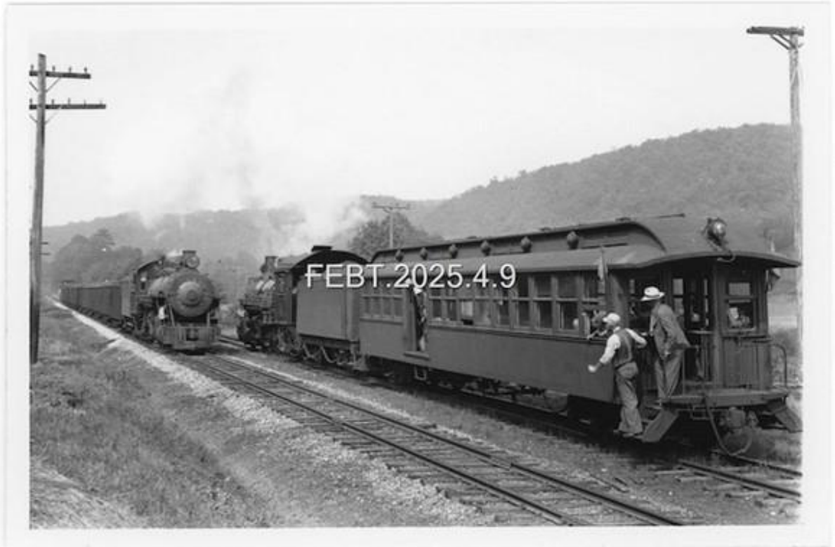
A southbound combine consist waits on the siding at Pogue for a northbound coal train.

Also, a $5,000.00 NRHS Heritage Grant was awarded to the FEBT for the "East Broad Top Railroad Archives: Secure Storage Project." The funding will support the purchase of archival shelving units and accessories.