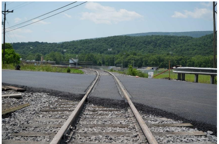
A lot has changed on the March to Saltillo from 2023 to now. Progress is continually being made on the southward restoration, and the 994 crossing is the latest item that FEBT has made possible.