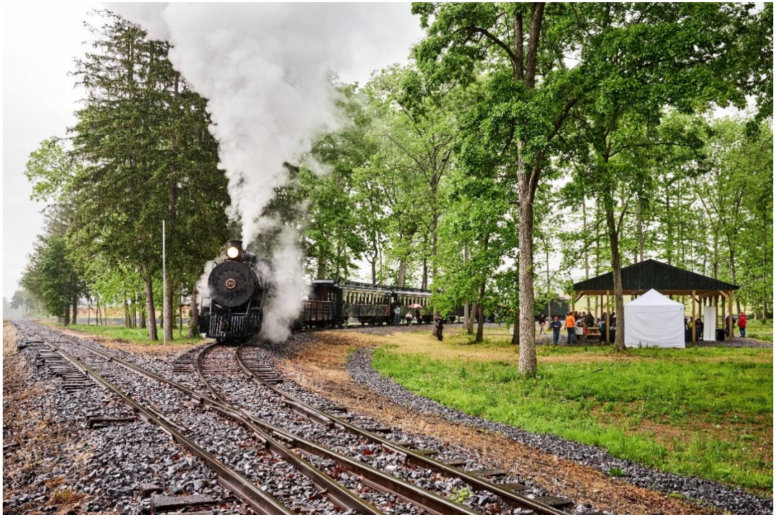
No. 16, with the 4:30 special train in tow, awaits on the Colgate Grove wye during the FEBT 40 th Anniversary celebration. The new pavilions see their first use as FEBT members enjoy a good meal and even better fellowship.

Over 100 FEBT members gathered on Saturday, May 20 th , 2023 to celebrate the incorporation of FEBT 40 years before. Rain fell as the crowd collected on the Orbisonia Station platform to board the chartered train to Colgate Grove. With a yellow FEBT banner and large “40” balloons on the caboose railings, the train carried everyone to the Grove where a catered picnic awaited. The 40 th celebration marked the first use of two new pavilions at the Grove. Fortunately, the rain broke shortly after arrival and everyone enjoyed the meal amongst new and old Friends alike.