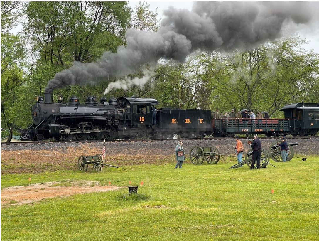
No. 16 returns to Rockhill during the EBT Goes to War! event with troops onboard and artillery waiting on May 13 th .