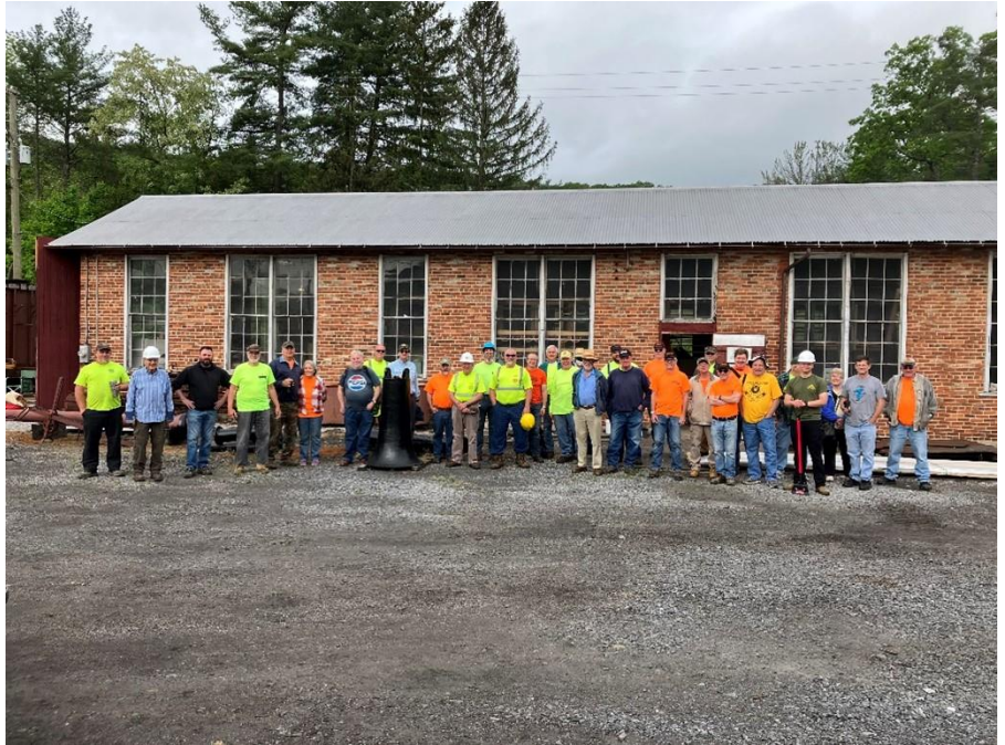
The May Work Session participants gather outside the Paint Shop on the morning of Saturday, May 20 th .

The week started on Saturday 5/20 and work began on multiple projects that progressed throughout the week. The track crew was busy all week with multiple projects. Alignment and surfacing were completed on the mainline near Horn's Cut, additional ties were installed in Track 4 in the yard, and over 800 feet of new ties were spiked south of the Rockhill yard to the Odd Fellows Cemetery Rd. crossing.