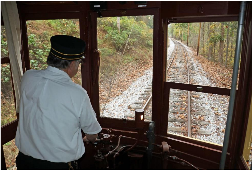
Picture yourself here, as a trolley motorman, enjoying the summer breeze while operating a piece of historic equipment along the former Shade Gap branch of the East Broad Top.

“No visit to the East Broad Top Railroad is complete without a ride on the Shade Gap Electric Railway.” Visitors to Orbisonia have heard this sentiment since the 1960’s. Volunteer trolley operators are needed to help keep this long tradition viable.