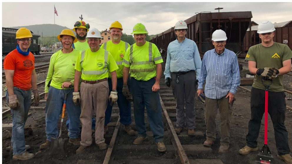
Above: Ties are staged for installation in the main line between the coal dock and the Oddfellows Cemetery Rd. grade crossing at the southern-most point of the Rockhill Yard.