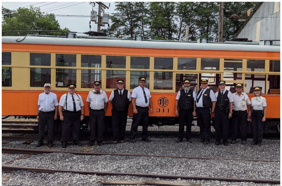
Come join a fun group of trolley operators at the Rockhill Trolley Museum.

Training will be provided. Contact the trolley museum info@rockhilltrolley.org or explore the Rockhill trolley Museum’s website at www.rockhilltrolley.org for additional information.