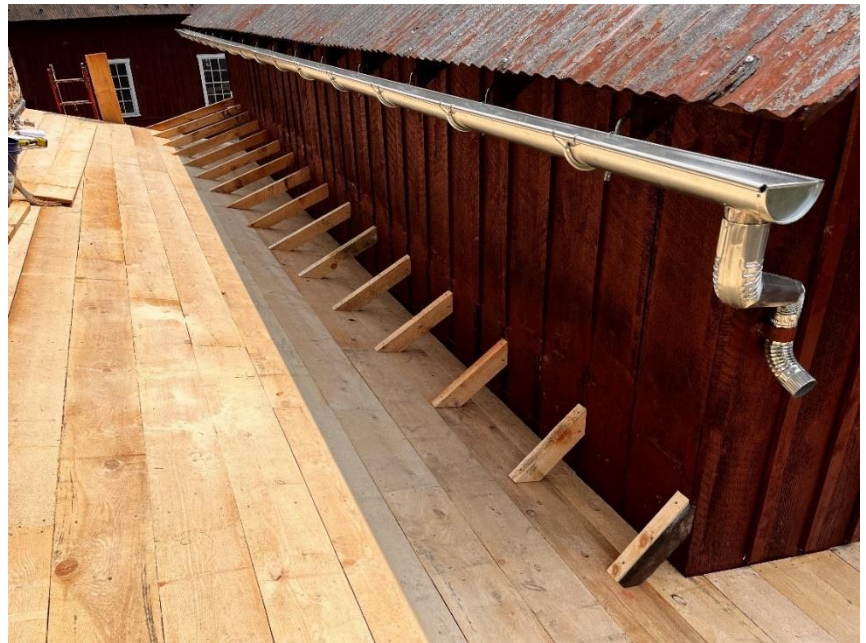
Right: The completed subroof and new gutter work above the lean-to.