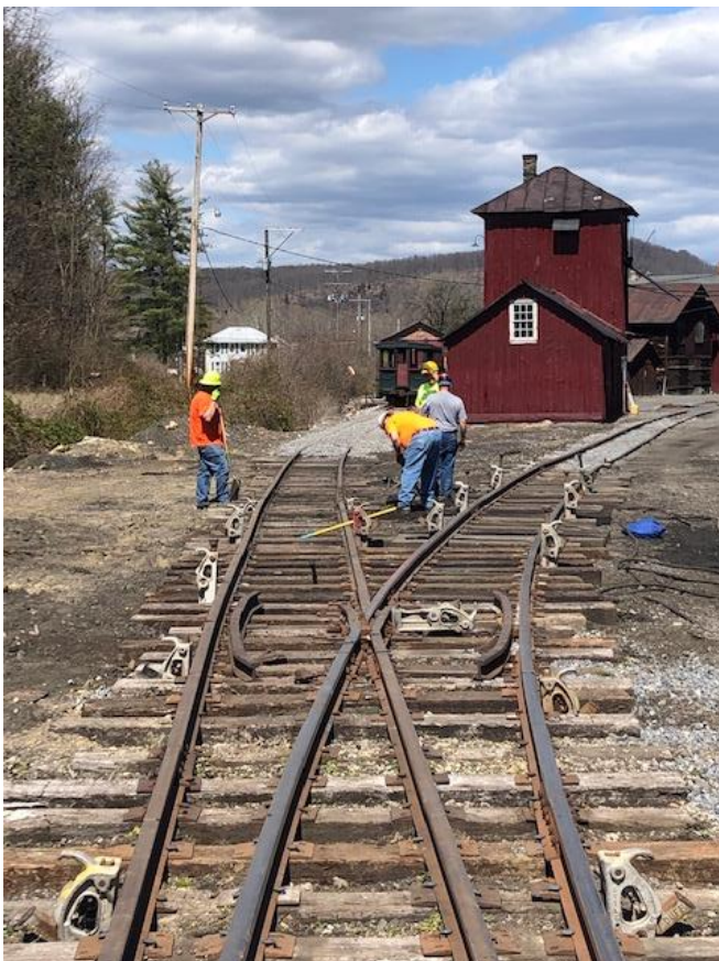
During a mid-week trackwork session on April 4 th, the crew levels and regauges the Paint Shop and Roundhouse lead tracks on the western edge of the Rockhill yard.