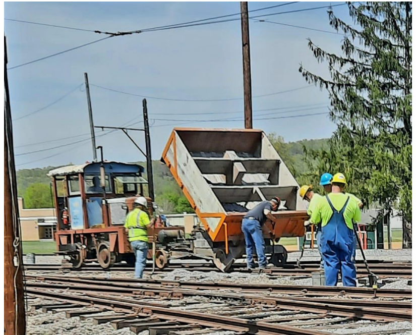
Like a good neighbor, the FEBT Track Crew is there, assisting the Rockhill Trolley Museum in the Car Barn 2 yard area with tie replacement during the week of April 17 th.