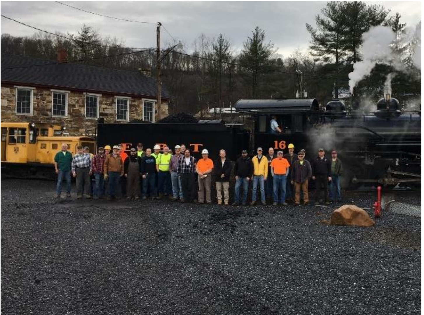
No. 16 builds steam pressure behind the assembled group of FEBT volunteers on the morning of April 1, 2023, during the early April FEBT Rockhill Work Session.