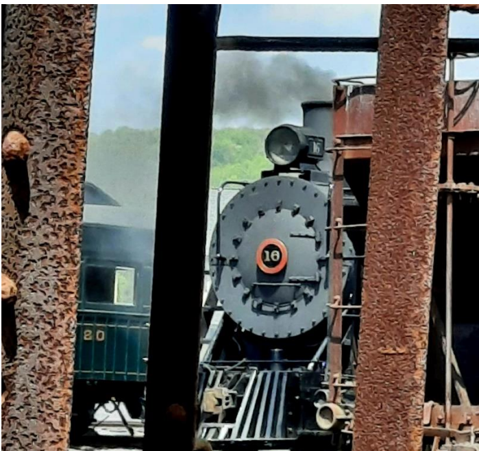
No. 16 peers from behind coal hoppers in the Rockhill yard during a Lerro Photography photo shoot during the final week of April.