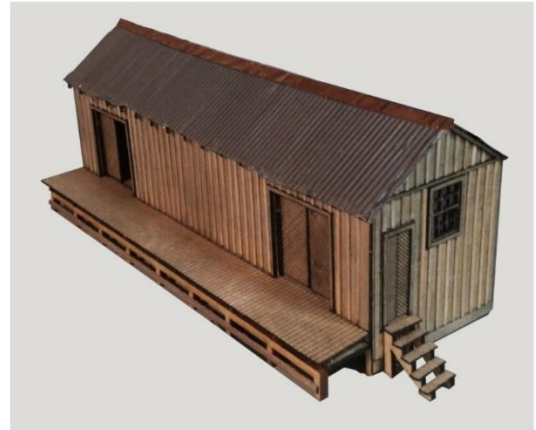
Robertsdale Freight Depot from Southern Heritage Models

2023 EBT Calendar $10 That's Half Price!