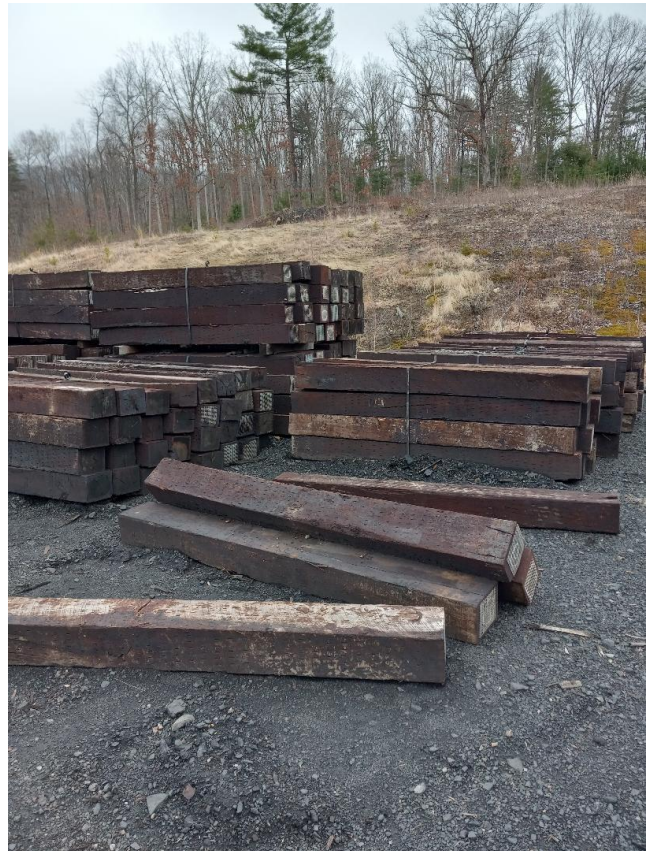
A pile of ties stored in the Rockhill Yard awaits installation by the FEBT Track Crews.