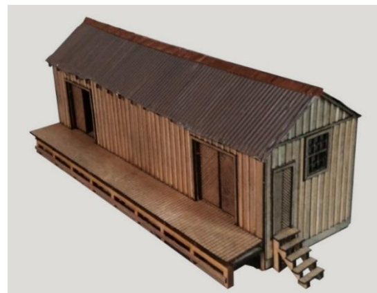
Robertsdale Freight Depot kit from Southern Heritage Models

Go to the Company Store at https://store.feht.org/ for more information and to order.