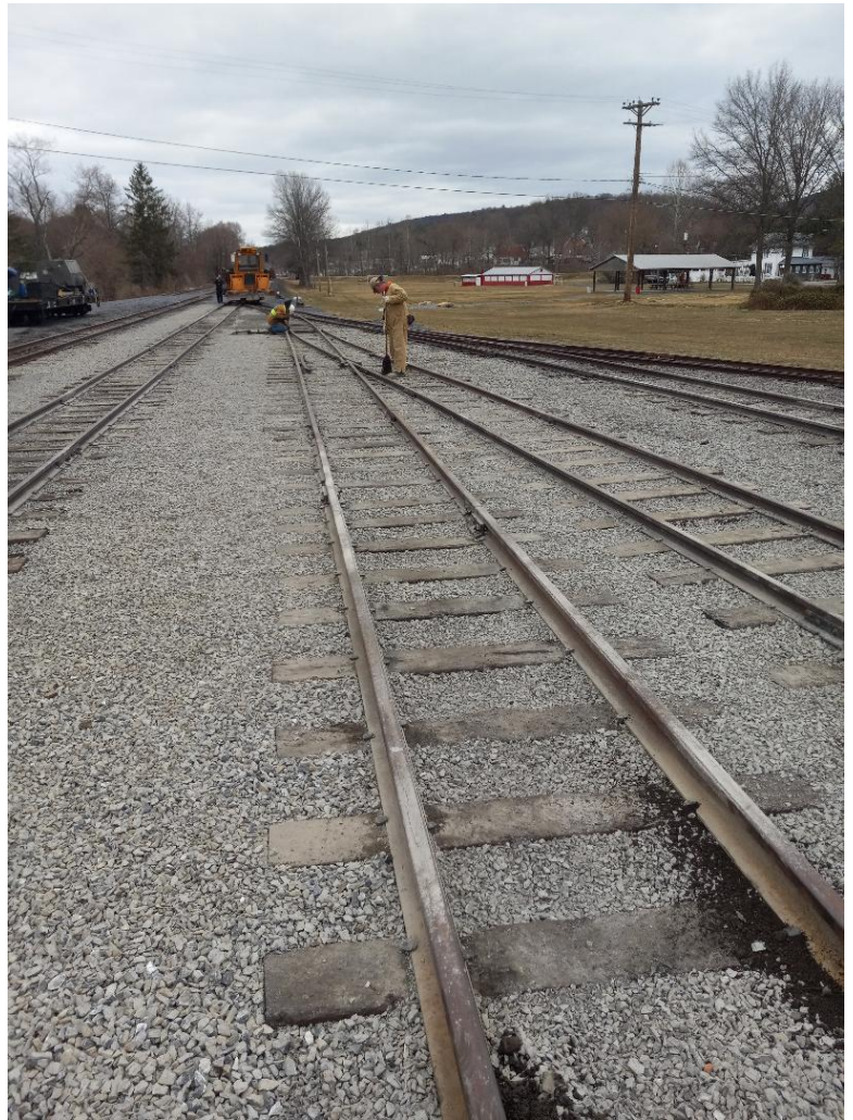
The results of the EBT Foundation and FEBT working together to resurrect the East Broad Top Railroad are on display in this March 14 th picture of the rejuvenated trackage on the north end of the Rockhill Yard.

We invite you to join us! We on the track crew think we have more fun than just about anyone at the railroad. (In the midst of all this fun, we also manage to get things done.) – Gene Tucker