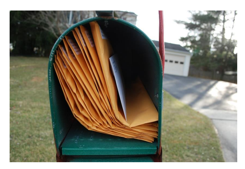
The Membership Office mailbox, stuffed full of outgoing new member packets.

The Friends of the East Broad Top membership is up to 1864