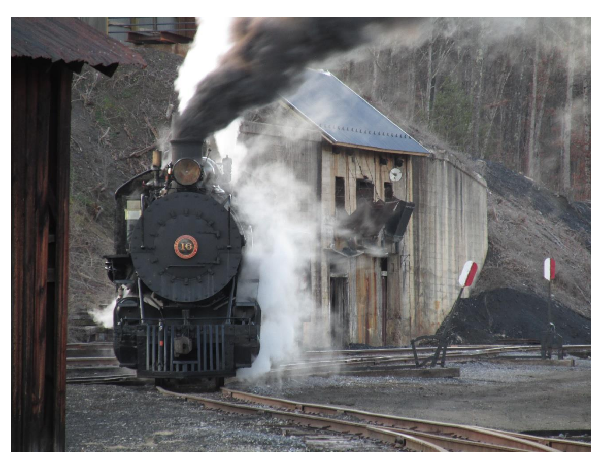
No. 16 steams south through the Rockhill Yard en route to collect her cars for the first EBT revenue steam-powered train since 2011.

We had a cold but productive winter work session in Rockhill the weekend of February 4<sup>th</sup> and 5<sup>th</sup>. We had 19 hardy souls attend on Saturday and 18 on Sunday. The carpentry crew continued work on the south end of the Car Shop. By the end of the weekend new siding was installed on all six new shop doors. Another crew worked on Combine 14 in the Paint Shop. Progress included siding installation on the south end of the car, installation of the coal stove, and sanding of the ceiling to prep for paint. We also had a good-sized crew working on the Storehouse. The last of the material for the first floor was moved from the storage container back to the Storehouse. We then spent most of the weekend sorting hardware that had become mixed up over the years and had been temporarily placed in the engineer's cubby. This will allow all hardware to be returned to the correct historic bin locations. – Dave Bulman