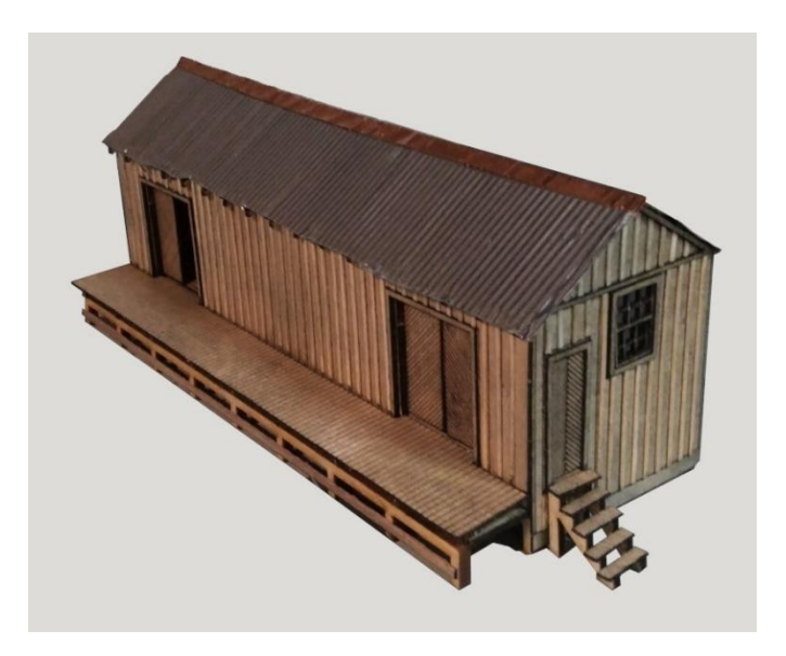
Robertsdale Freight Depot kit from Southern Heritage Models

Robertsdale Freight House Kit from Southern Heritage Models (O Scale) Rockhill Electrical Shop from Banta Modelworks (HO Scale) Drawings of Billmeyer & Smalls Wooden Coal Cars by Greg Vaughn