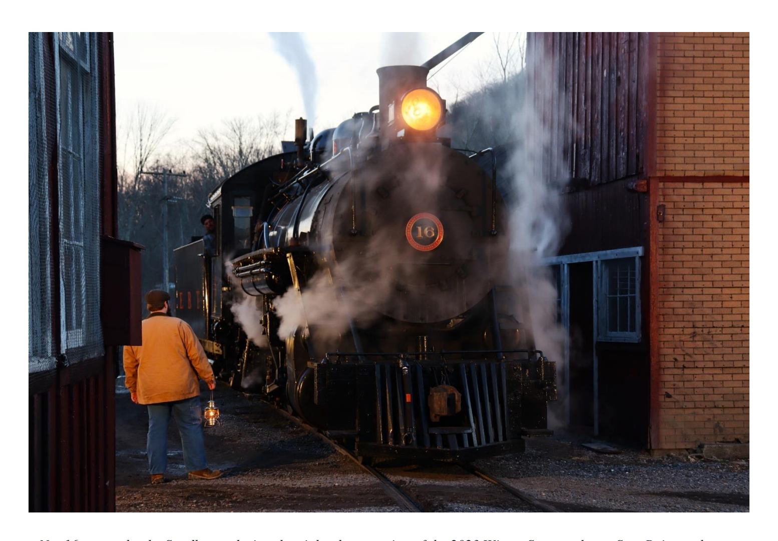
No. 16 pauses by the Sandhouse during the night photo session of the 2023 Winter Spectacular.

Friends of the East Broad Top, Inc. (FEBT) is a 501(c)(3) nonprofit, historical, and educational society dedicated to the preservation, restoration, and interpretation of the East Broad Top Railroad National Historic Landmark in Huntingdon County, Pennsylvania. It was organized in 1983 and now boasts over 1,800 members. FEBT publishes an award-winning magazine, Timber Transfer , and a monthly e-newsletter, and operates a museum in Robertsdale PA, the EBT's southern terminus. See <a href="febt.org/">febt.org/</a> for more information.