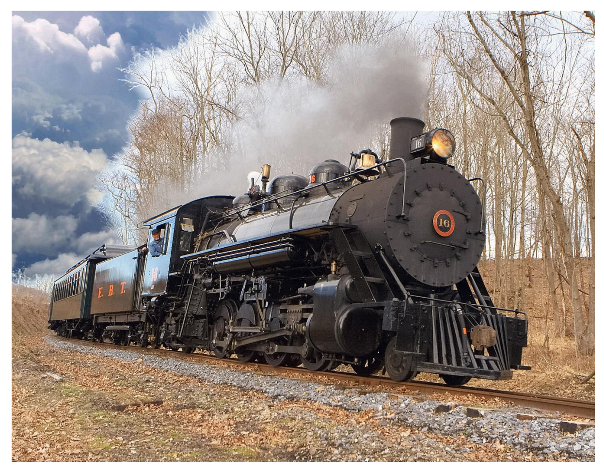
No. 16, with passenger consist, makes her way northbound through the S-curve.