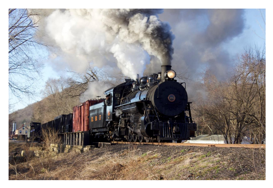
A northbound morning freight clears the Rockhill Yard limit.