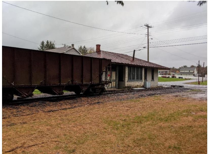
One goal for 2023 is to improve the appearance of these hopper cars on the Scale Track in Robertsdale.

If you ask anyone who has done it, this work is great fun. Proof? Everyone who did it last year has offered to do it again (except where health and job issues have come in). Everyone who does it, wants to do it again – that should tell you all you need to know. All except that, we need your help. FEBT and the Robertsdale Museum are 100% volunteer. We need you. We already have this year's schedule, including that we have dates for our training days. Send me an email, join the team.