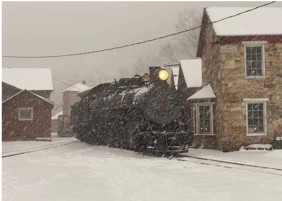
A driving snow comes down on the Rockhill Yard during a Lerro Photography photo shoot in December 2019. This was the last public event the Kovalchick family hosted prior to the sale of the railroad to the EBT Foundation in February 2020, three years ago this month.