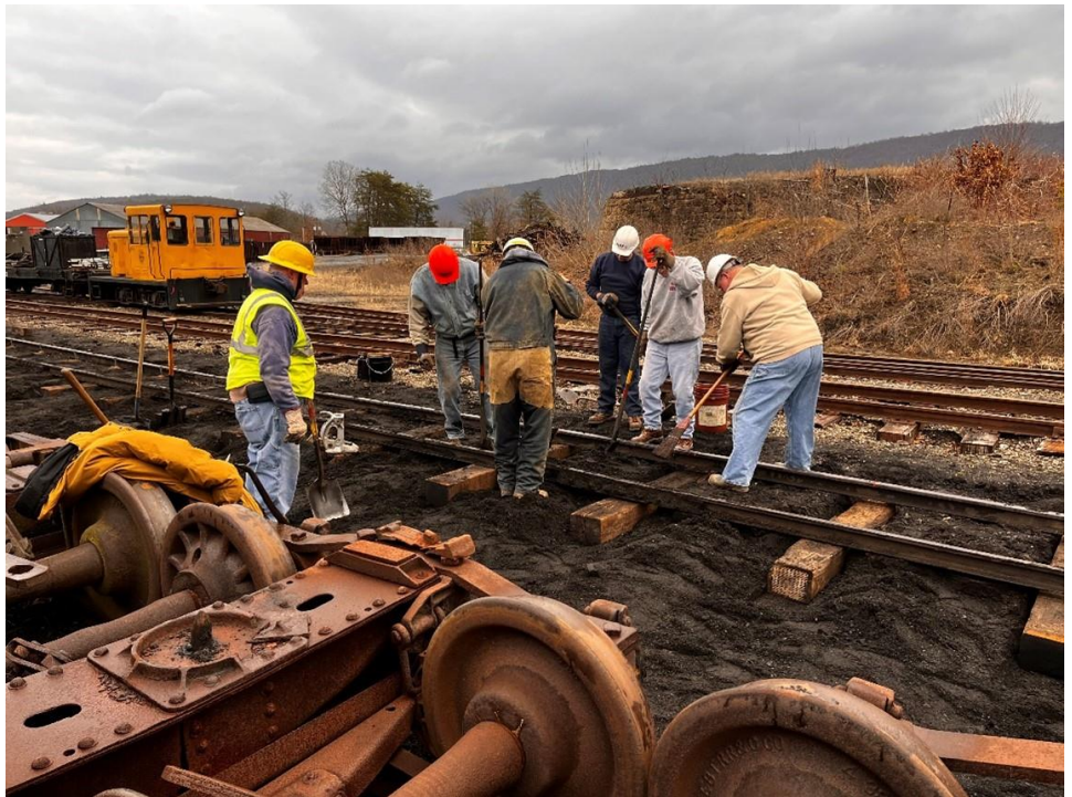
Trackwork in the Rockhill Yard is sure to be even more fun to join as the weather warms up. This photo shows the RIP track under repair during the January 2023 work session.

Combine 14 will see the completion of the new exterior siding installation, and continued progress to complete the interior assembly and painting. Boxcar 174 will see continued metal repair and replacement to get it ready for service.