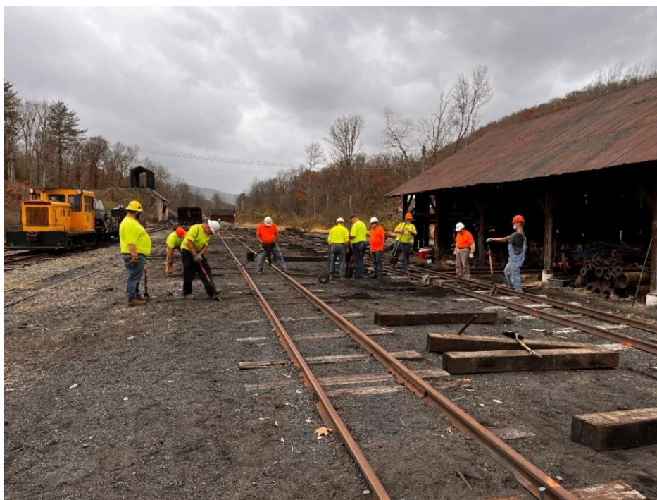
The FEBT Track Crew works to replace ties in the south end of the Rockhill Yard during the November 2022 Work Session.