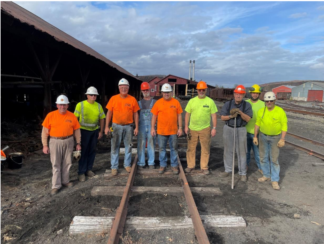
The FEBT Track Crew poses towards the south end of the Rockhill Yard at the end of the day during the November 2022 Work Session.

FEBT's track forces have concentrated their recent efforts on the leads between the triple stub switch and the Car Shop, on tie installation south of the Heavy Repair Shop, and in work on the stub switch south of the Car Shop. Here's a summary of our doin's: