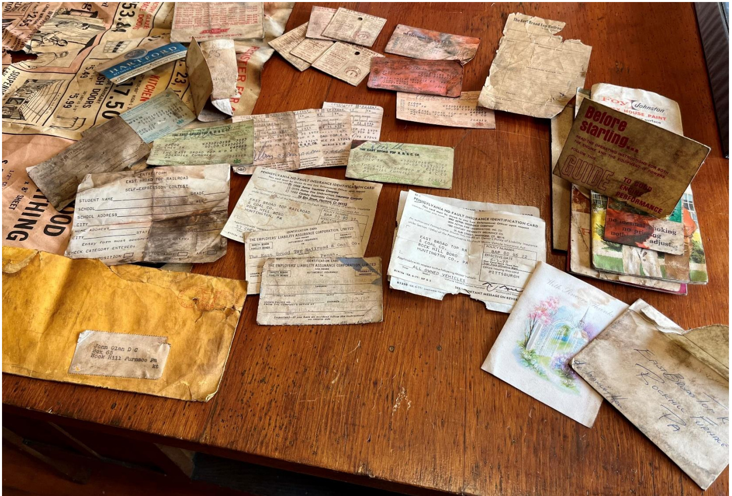
A collection of items the EBTRR&CCo Archives and Special Collections Program has uncovered.