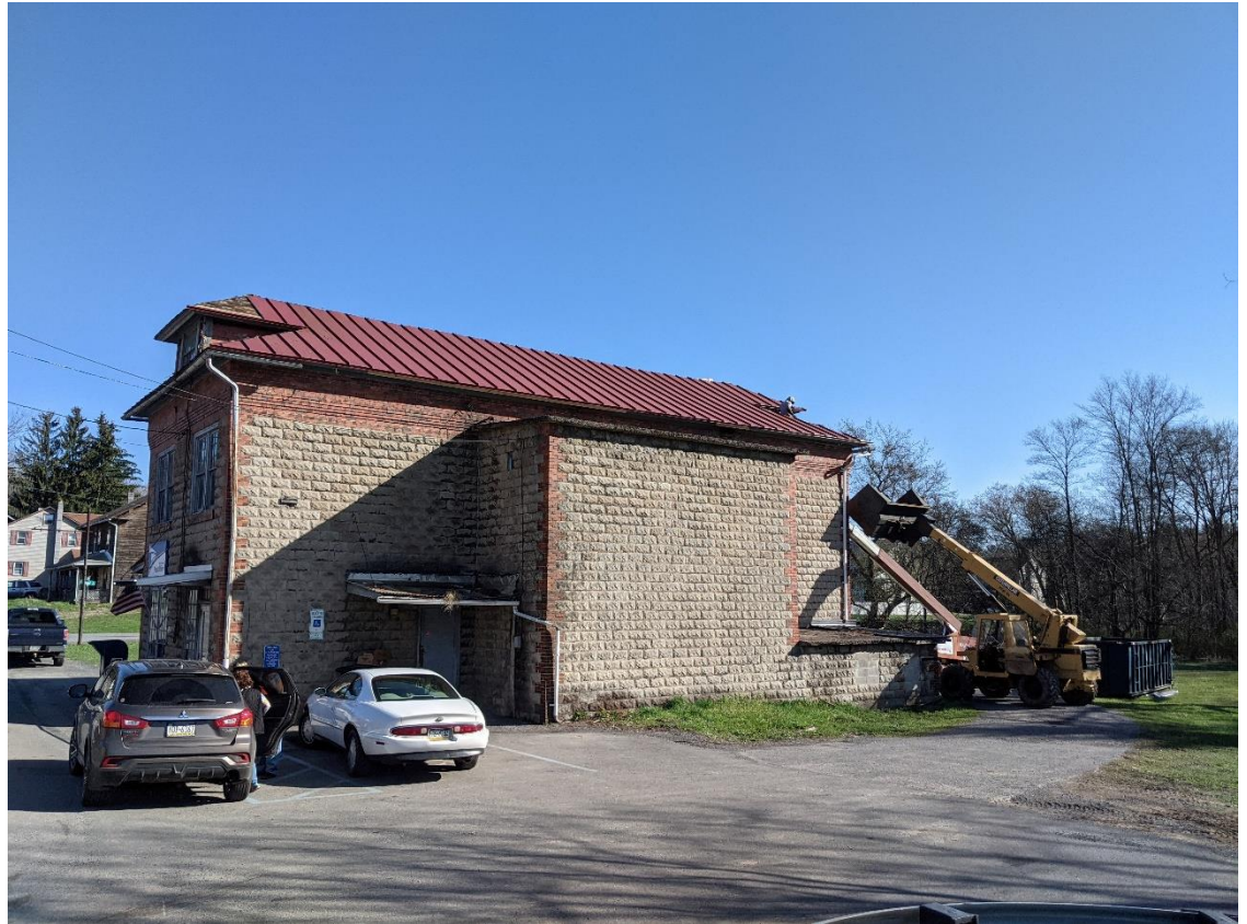
The Rockhill Coal & Iron Company office building in Robertsdale's Company Square sees a roof renovation project in progress. This structure is owned by the EBT Foundation, while the other two remaining buildings are owned by FEBT.

I bet you wish that FEBT offered something other than T-shirts. Is that a hint that you should visit? They look great!