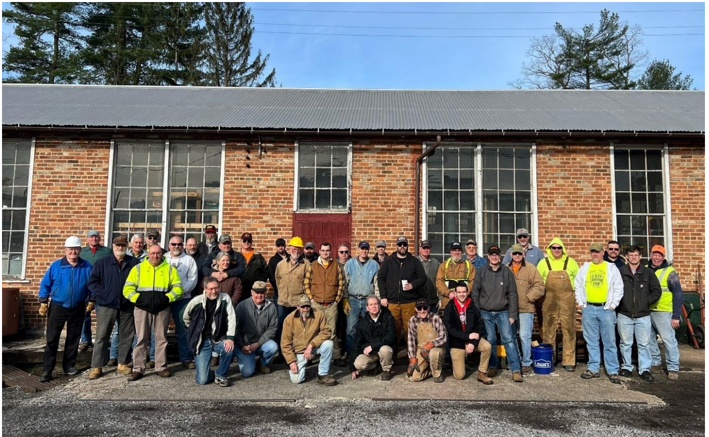
A large group of volunteers poses for a picture by the Paint Shop at the early April 2022 Work Session.