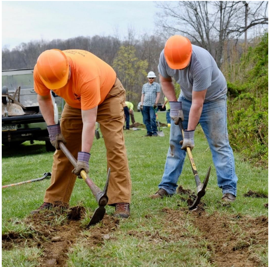
The FEBT Track Crew begins the process of uncovering the main line in Three Springs, which is buried by over a half century of overgrowth.