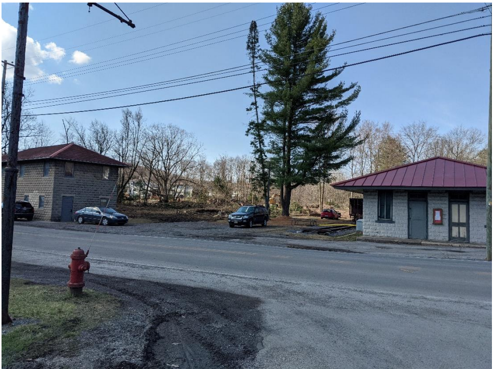
Comparison shots of the tree clearing in Robertsdale. The top photo is from September 2021, and the lower picture is from March 2022.