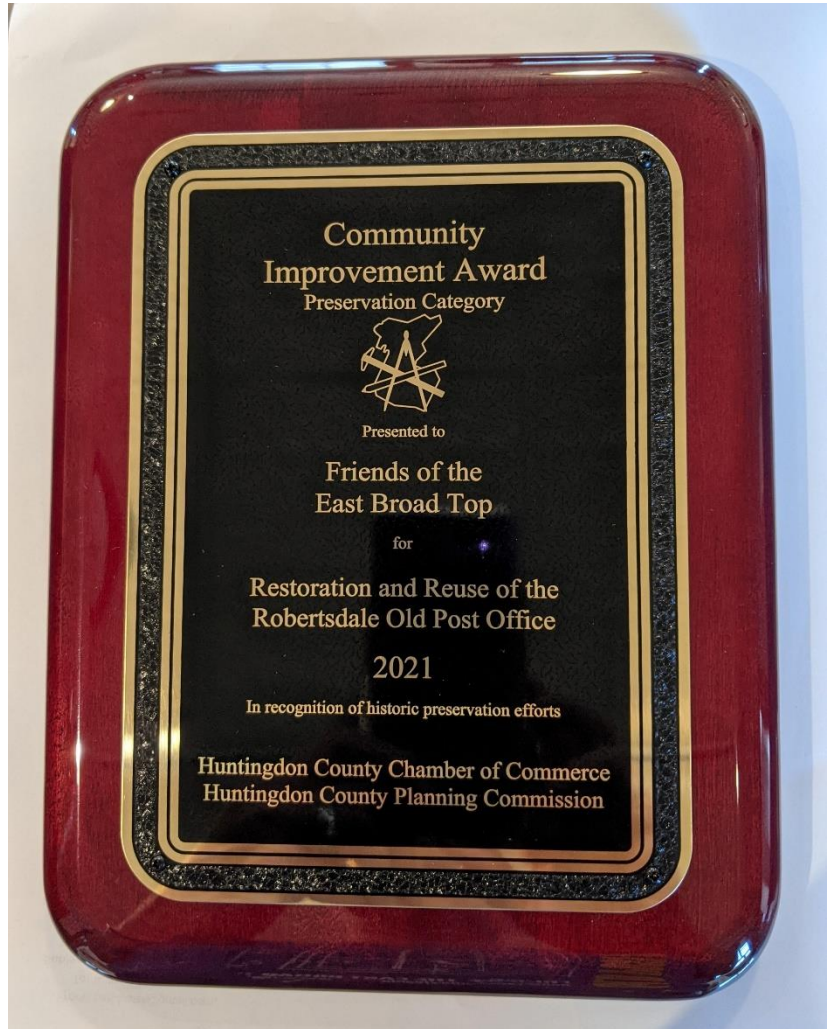
This plaque was awarded to the FEBT for the restoration efforts undertaken regarding the Robertsdale Old Post Office's transformation into the FEBT Museum.