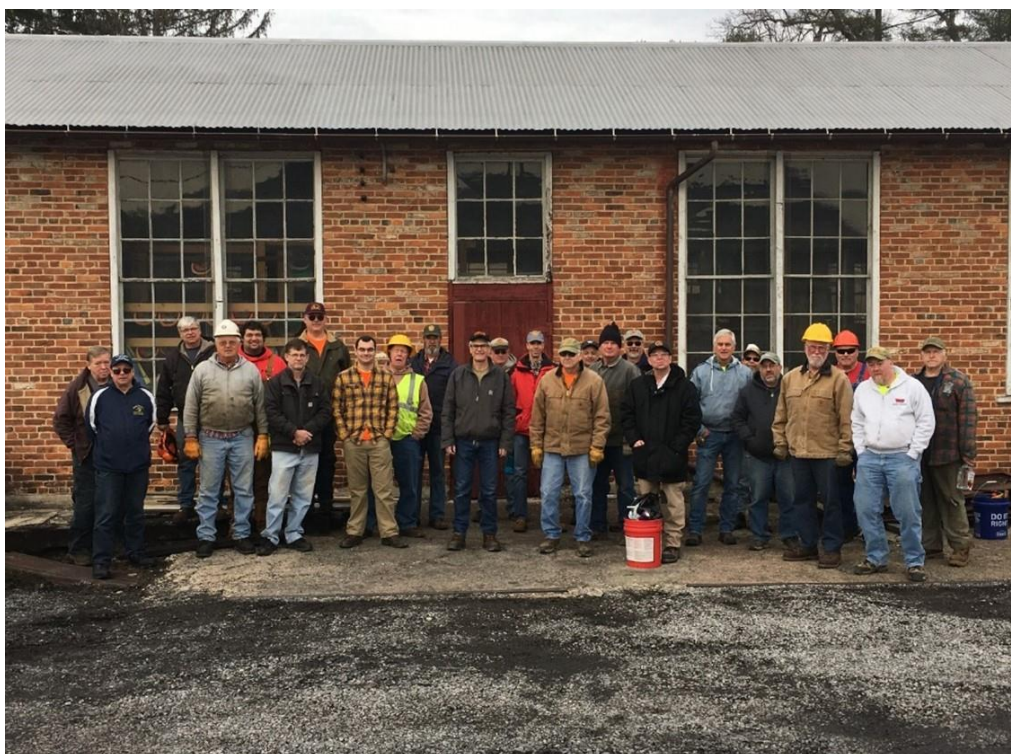
A crowd of volunteers poses outside the Paint Shop during the March 2022 Rockhill Work Session.