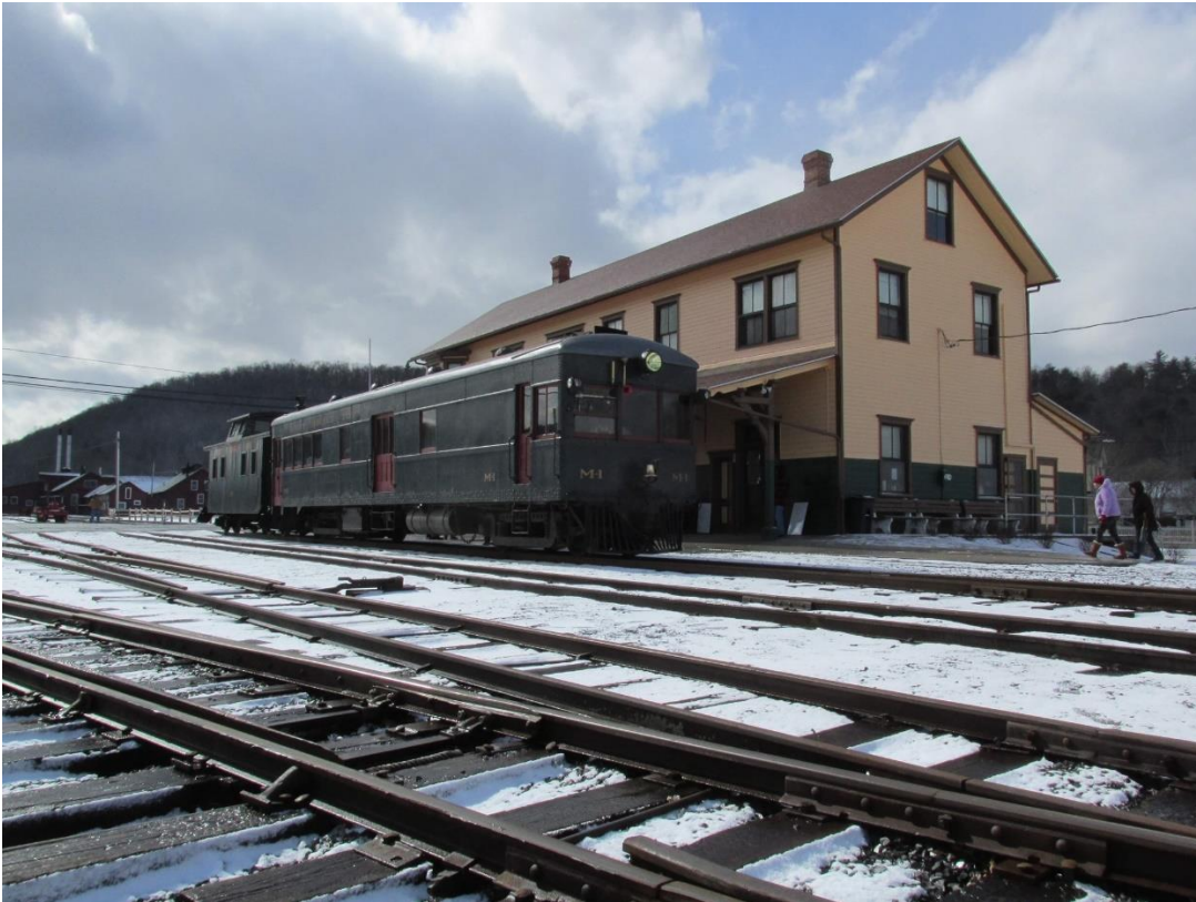
Snow covers the ground in the Aughwick Valley as the M-1 awaits its next run during the 2022 Winter Spectacular.

The museum is still free. The museum will still gladly accept your donation. So, make your plans to visit, and offer to join our host team. – Pete Clarke