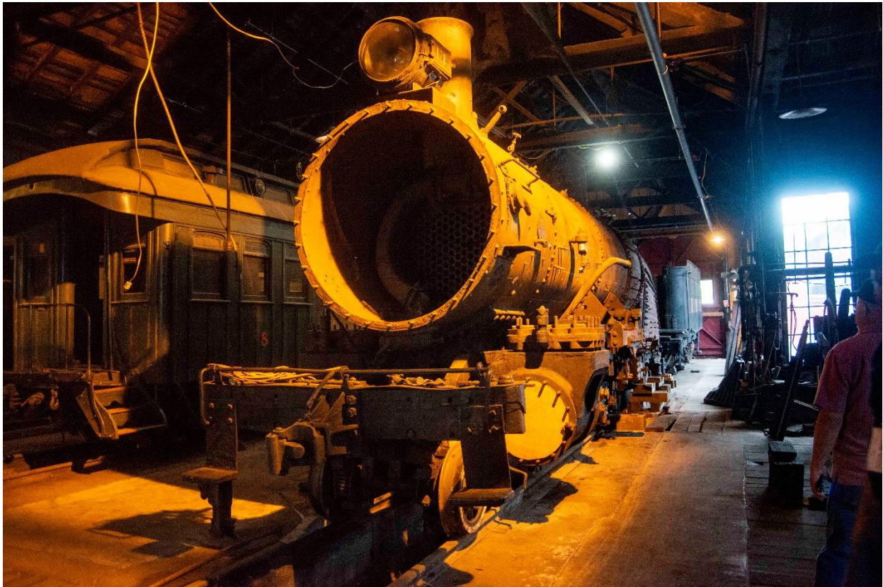
Engine No. 14 sits in the engine shop during the 2021 FEBT Reunion as restoration continues.