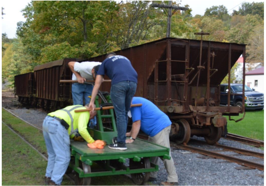
FEBT volunteers inspect the gears of the handcar during the FEBT Reunion on October 8, 2021. The hopper car display in the background is what requires painting and lettering in 2022.

The Robertsedale Museum includes a very nice walking tour of the area from the wye down to mine 1 and mine 5. We'd like to get a true walking trail built. As I write this, we have plans to meet with a member who is a landscape designer to discuss how we can make this happen. I don't know how much of this can be done with machines or how much will require guys and gals with shovels. Expect to hear some crew calls for this job. We hope to enhance the walking tour further by installing informative signs along the way. If designing these interests you, shoot me an email.