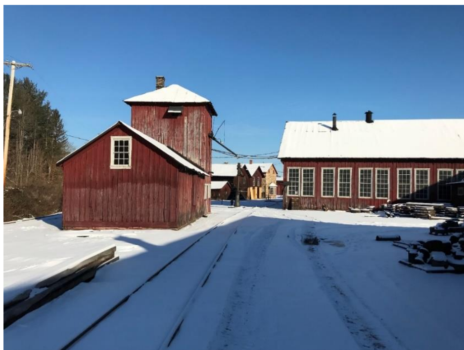
A crisp and clear Saturday morning in Rockhill Furnace during the January work session. Note the storehouse in the distance.