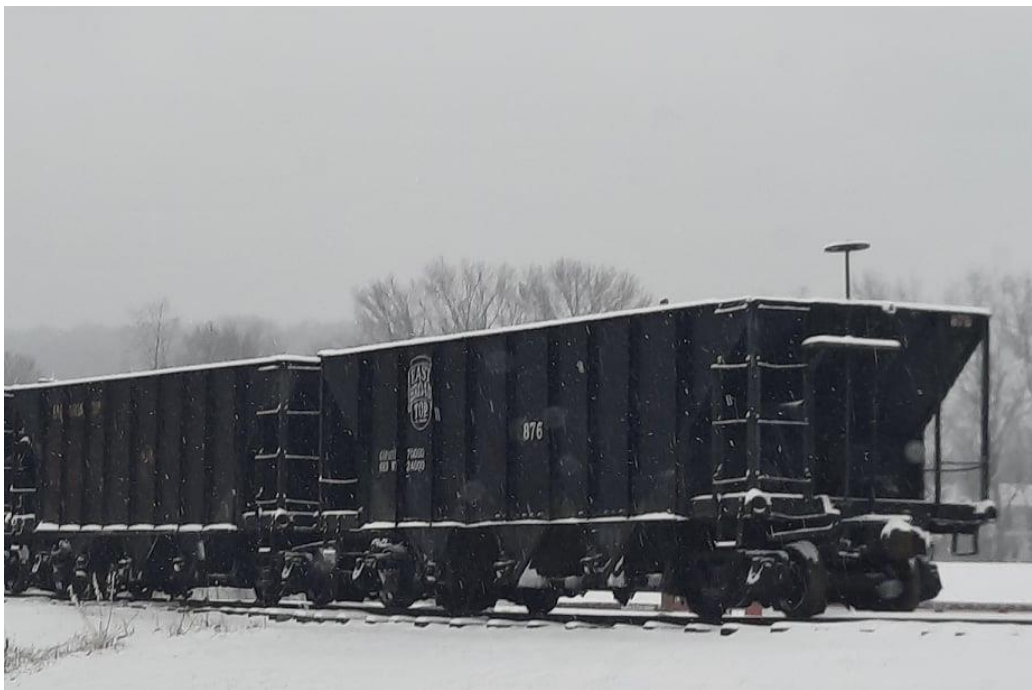
Hopper cars covered in snow in the Rockhill Yard in late December 2021.

Friends of the East Broad Top, Inc. (FEBT) is a 501(c)(3) nonprofit, historical, and educational society dedicated to the preservation, restoration, and interpretation of the East Broad Top Railroad National Historic Landmark in Huntingdon County, Pennsylvania. It was organized in 1983 and now boasts over 1,600 members. FEBT publishes an award-winning magazine, Timber Transfer , and a monthly e-newsletter, and operates a museum in Robertsdale PA, the EBT's southern terminus. See febt.org/ for more information.