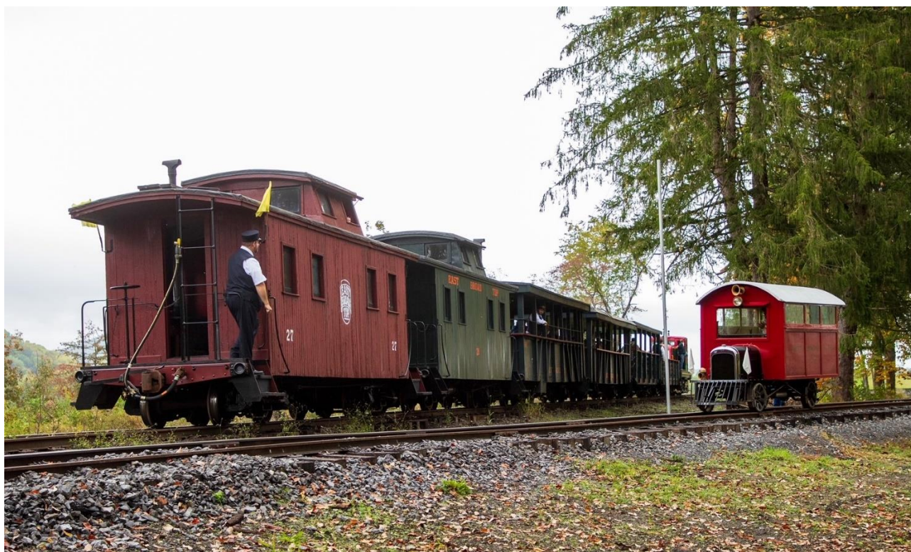
The M-3 waits for a passenger train to clear at Colgate Grove wye. The M-3 was rebuilt a few years back by FEBT members, and the train is crossing over the location of the Golden Spike installed at the conclusion of joint track restoration efforts by the EBT Foundation and the Friends of the East Broad Top.