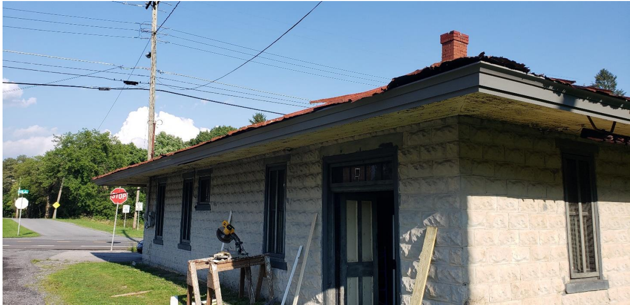
This August 22 nd , 2021 view from the southeast shows that the fascia boards on the Robertsedale station structure are now installed and painted. Roof replacement will begin soon.