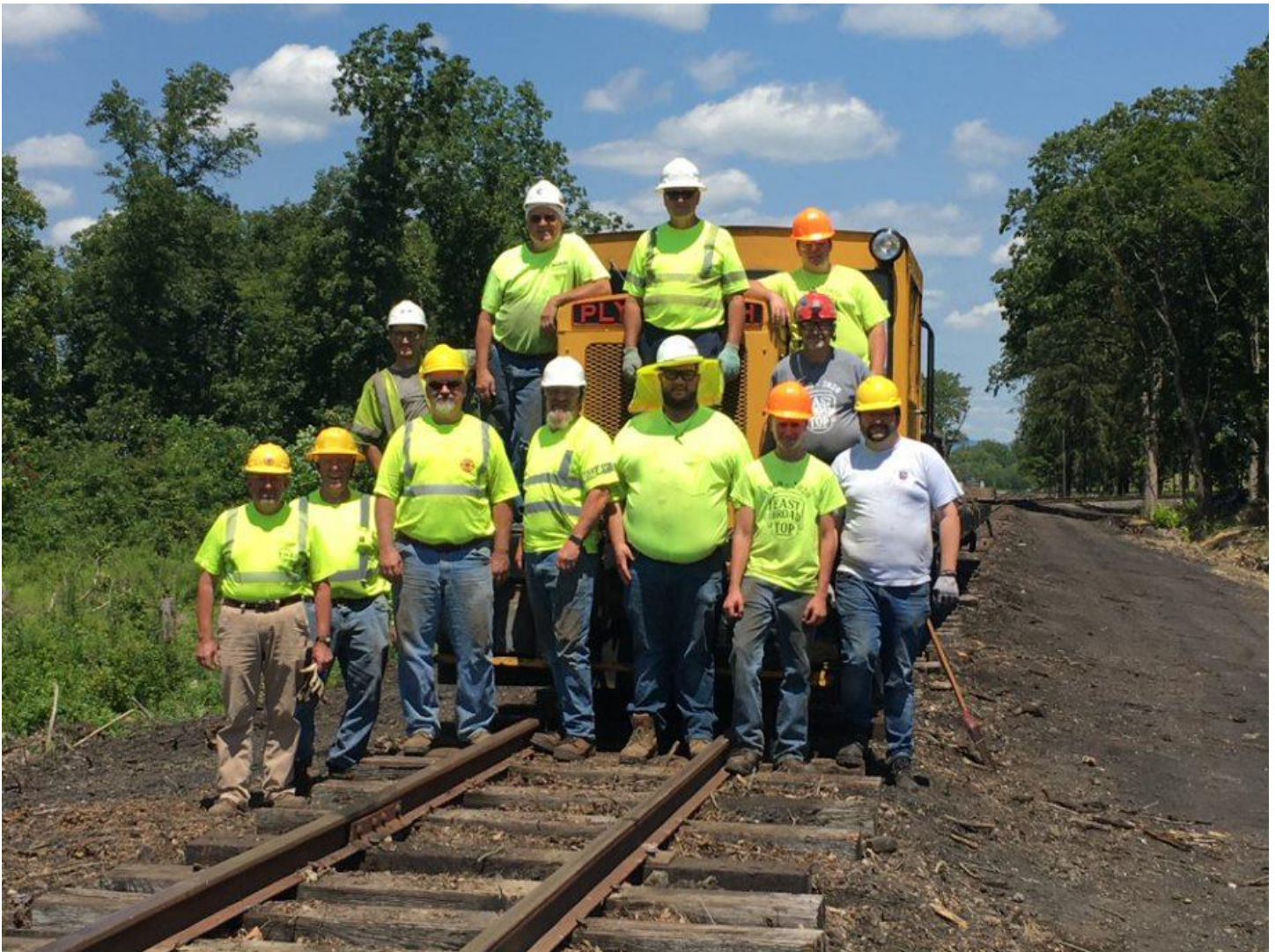
The July 31, 2021 FEBT track crew poses with the M-6, with Colgate Grove in the background.

Water is a curious thing: It is necessary to life, including the life of the trees from which the ties came, but under the wrong circumstances, it hastens the demise of things, including ties. Next time you have an opportunity to ride the train north to Colgate Grove, take a few minutes to admire the work of those who've improved the drainage along the track, who removed much of the canopy, and who not only installed the new ties, but also guaranteed a full life cycle for those new ties by tamping up the track to raise it up out of the "schmutz" that retains water. There's an often-unnoticed story in all of these things, one to be admired. – Gene Tucker