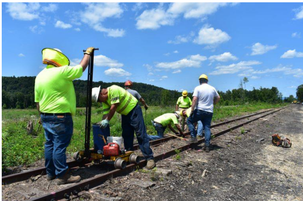
The FEBT track crew installs new rail joint bolts along the main line south of Colgate Grove on July 31, 2021.