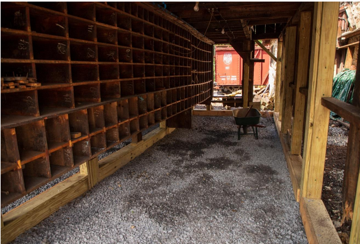
Left: The bins of the Storehouse sit much straighter now that the building has been raised and stabilized. The floor awaits a new concrete slab on August 21, 2021.