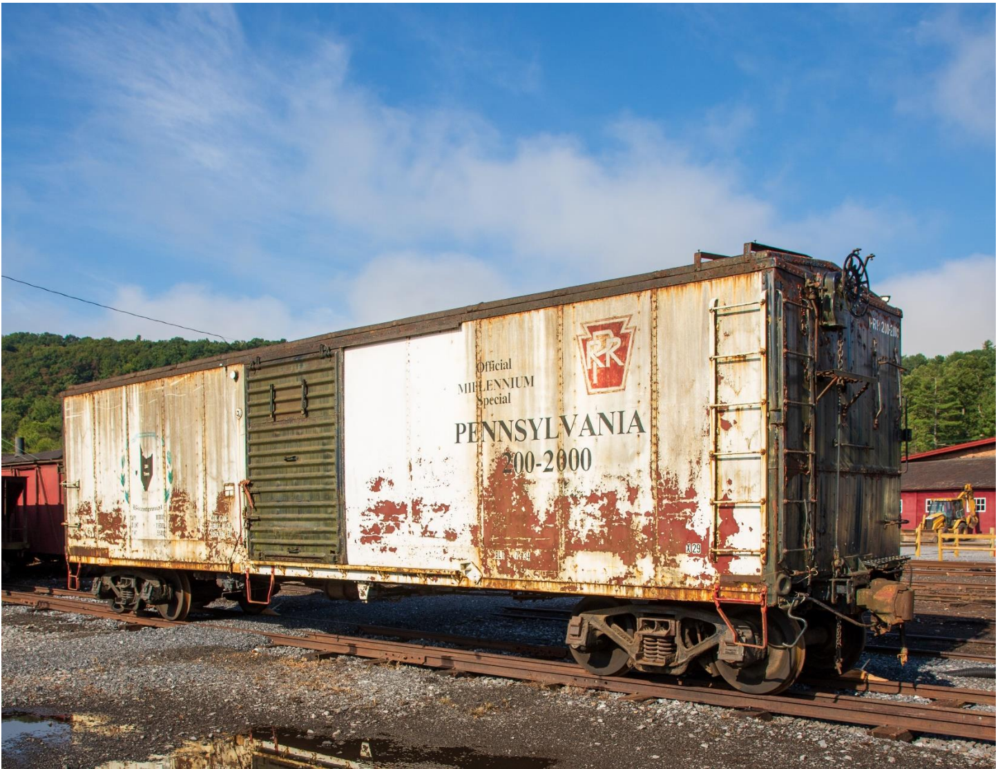
The recently acquired PRR X29 boxcar sits on the dual gauge portion of Track 7 in the Rockhill yard.