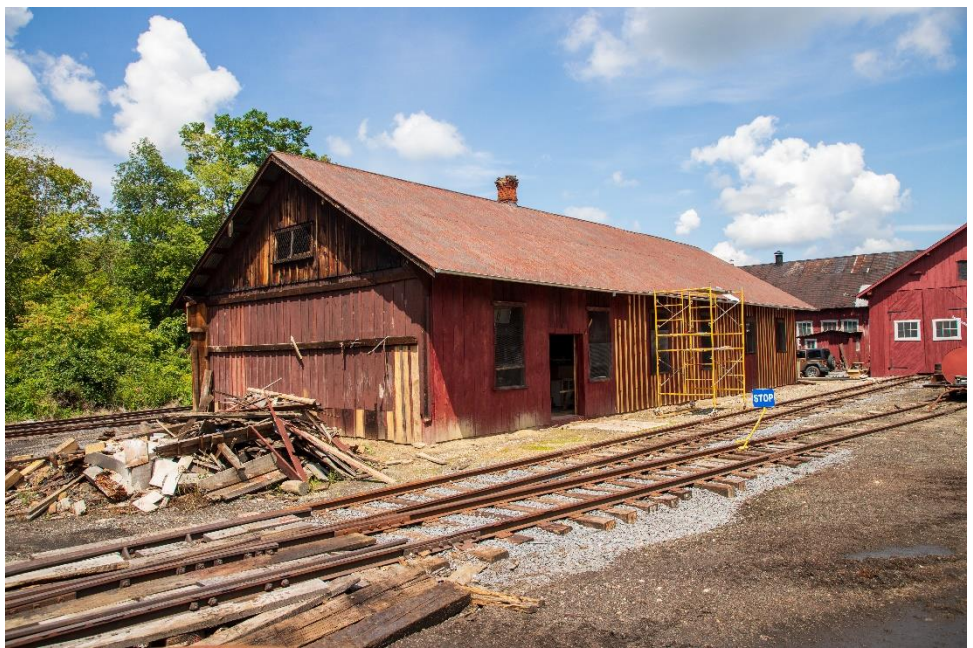
Battens are being installed on the Carpentry Shop during the August 2021 work weekend.