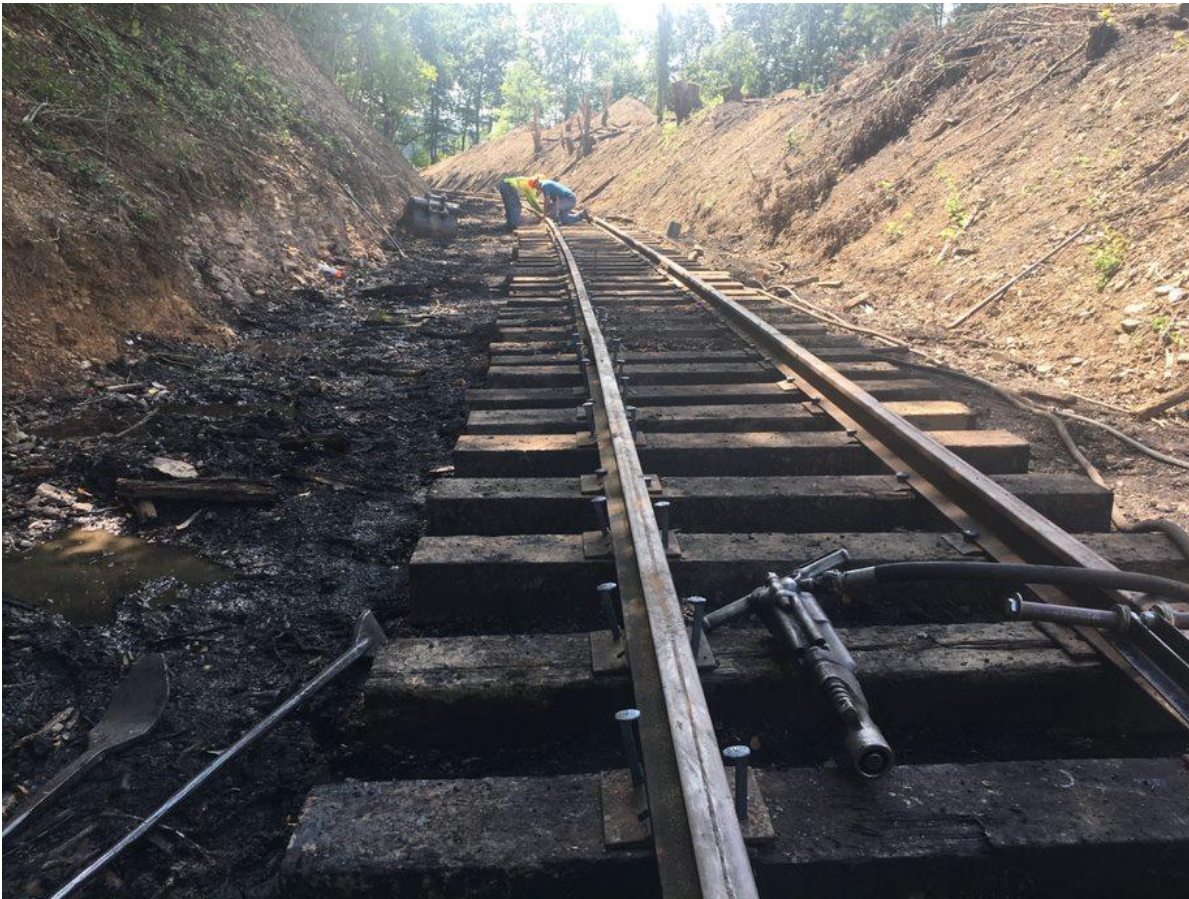
This July 2021 view of main line trackage restoration shows the efforts undertaken to clear the eroded slag and remove the canopy inhibiting evaporation. Ballast will be applied and then tamped to maintain drainage and level the track.

One of those steps is to ensure that the drainage structures for the track are in good condition. To that end, full-time personnel have spent a good amount of time installing new culverts under the track, digging out ditches, and cleaning out cuts where years of accumulated dirt have made their way around the ties.