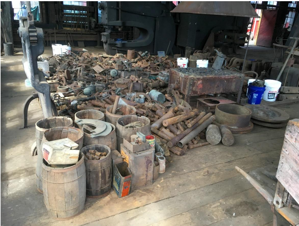
A variety of parts removed from the "engineer's cubby" of the Storehouse are now organized on the Machine Shop floor while the Storehouse receives restoration work.