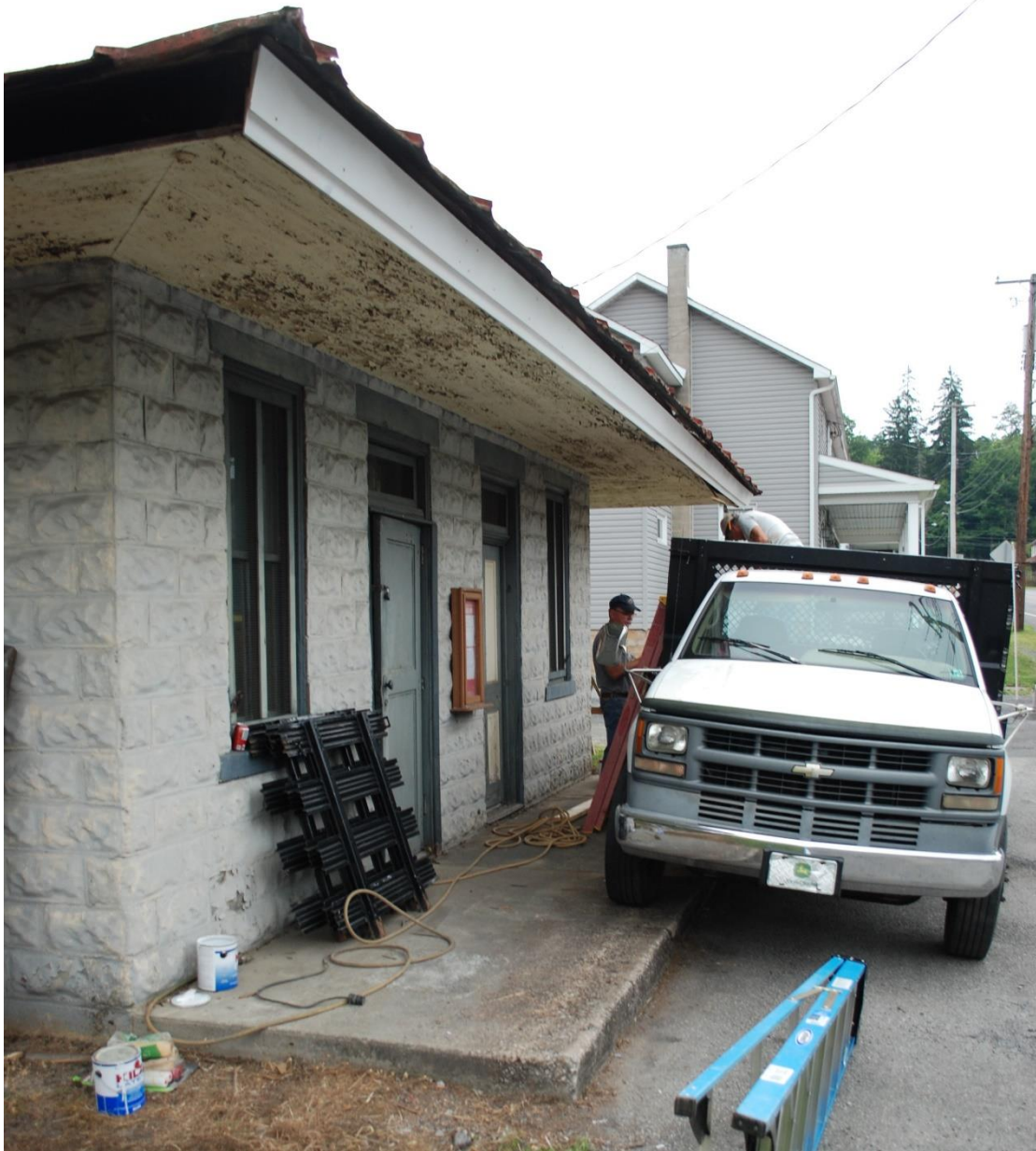
The north side of the Robertsdale station looks much better with the new fascia boards installed and primed. – Pete Clarke

Would you like to renew your membership? Do you want to pay with your credit card, but don't want to use the internet? You can now renew using your credit card at the museum. Stop by and the host on duty will be happy to help!