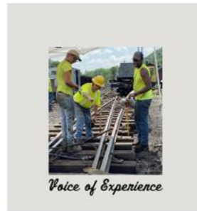
“Voice” ash back