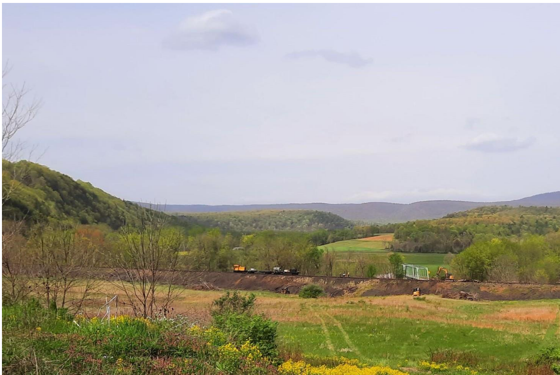
A scenic spring view of the Aughwick Valley on April 28, 2021 shows the views soon to be visible from EBT trains again, as the EBT Foundation track crew, augmented by FEBT volunteers, rebuilds trackage atop the long fill between Orbisonia and Shirleysburg.