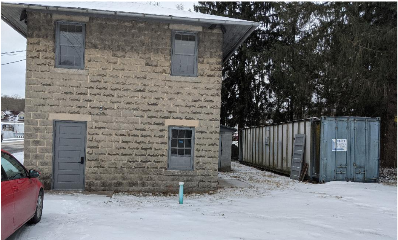
The storage container sits on the south side of the FEBT Museum building, and across the tracks from the Robertsdale Depot