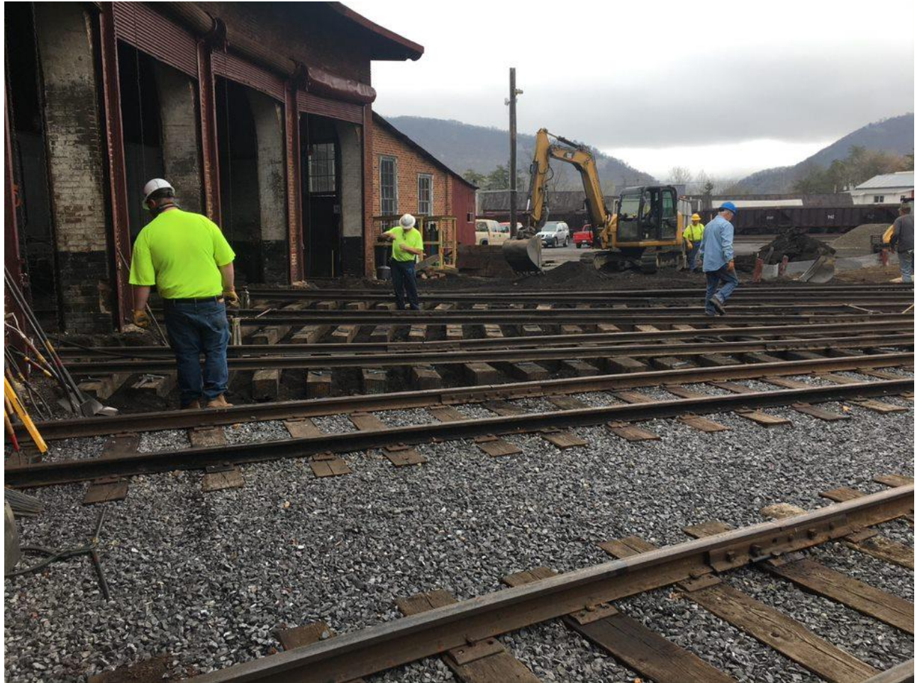
FEBT Track Crew rebuilds the roundhouse leads to the eastern half of the stalls during the April work session