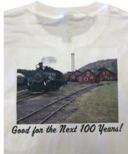
“Good” white back