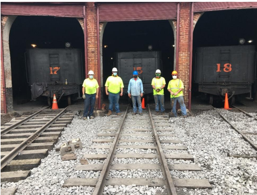
The FEBT Track Crew poses for a picture after ballasting the roundhouse lead trackage they finished rebuilding during the April work session.

www.febt.org www.eastbroadtop.com www.rockhilltrolley.org