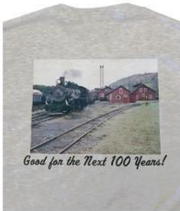
“Good” ash back

High quality, very soft Hanes shirts. FEBT logo on front left side, photo on back celebrating the rebirth of the EBT. Two styles: "Good for the Next 100 Years!" and "Voice of Experience". Two colors (ash and white) for "Good for the Next 100 Years!." "Voice of Experience" comes only in ash color. Sizes from small to XXL. Limited quantities!