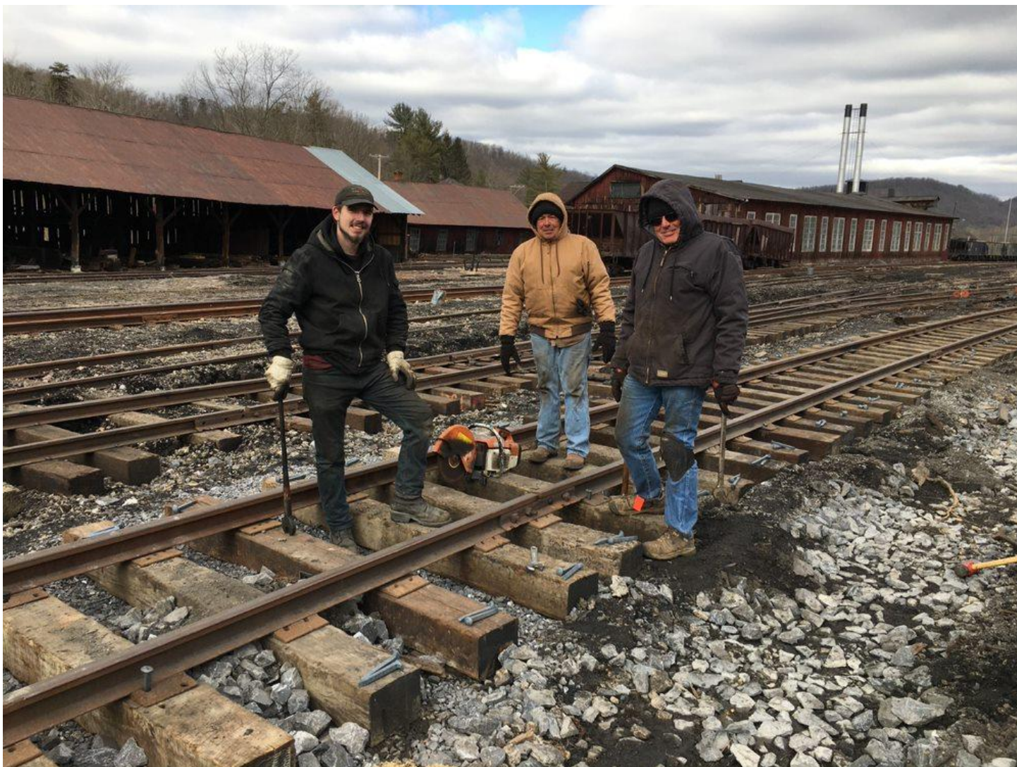
The track crew pauses on a frigid day while working on track bolts on the south leg of the Rockhill wye.