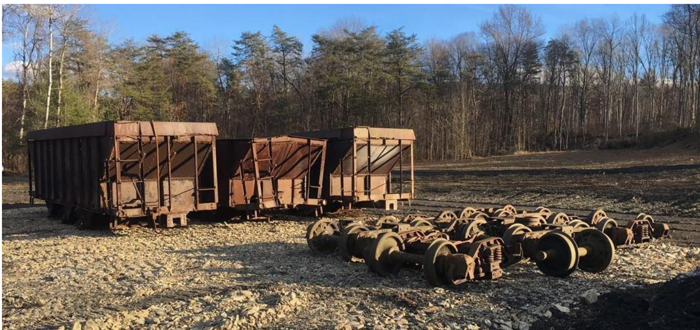
Several hoppers and box cars, as well as narrow gauge trucks for standard gauge cars, were recently recovered from Mount Union and brought back to Rockhill for restoration.

The East Broad Top Foundation has had a very productive first month of 2021. The shops at the Strasburg Railroad are working on rebuilding the safety valves for engines 14 and 16, as well as performing work on the drive wheels for #14. The Foundation has subcontracted Curry Rail Services in Hollidaysburg, PA to make repairs to Engine #16's tender. They are in the process of installing the new water tank within the tender. While the work itself will be new, everything is being rebuilt to the original specifications to preserve the historical authenticity. EBTF unveiled a new access road to Colgate Grove, which FEBT volunteers used during the January work session. A handful of cars were recovered from the Mount Union yard and trucked to Rockhill. Another item recovered was some of the trucks used at the Timber Transfer to put standard gauge cars on to traverse the narrow gauge trackage. The Foundation also vaguely announced plans to revive the Winter Spectacular event on February 20 th . More details are expected to be released on the railroad's website on Monday, February 1 st , at www.eastbroadtop.com . Several other events have been added to the calendar with future detail releases as well.