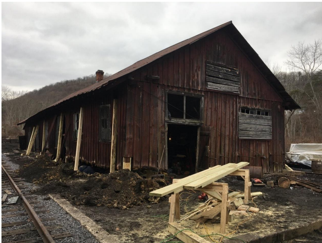
The East Broad Top Railroad's Carpentry Shop, as seen on January 27, 2021. This building is being stabilized with the aid of a grant from the Friends of the East Broad Top.