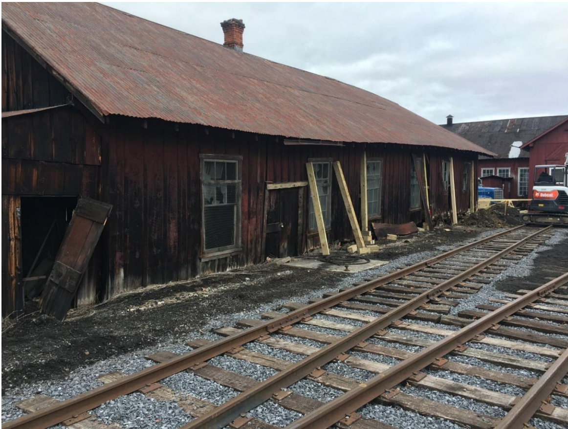
A view from the southeast corner of the Carpentry Shop as Woodford Brothers begins the stabilization process of the structure in January 2021.

Another restoration project has begun in the Rockhill Shops Complex. This time, it is the Carpentry Shop getting attention. Woodford Brothers Inc., of Apulia Station, NY, are once again at work saving a building in Rockhill. Work began on January 27, 2021 with jacking up the east side of the building. The building has sunk quite a bit over the last 100+ years of the building's existence. The contractors raised the east side of the building nearly two feet above where it had been sitting to get it to the height it should be. As was announced in the November 2020 FEBT Newsletter, this project was made possible by a $86,000 grant from the Friends of the East Broad Top to the East Broad Top Foundation. In case you missed the November newsletter, you can read about the grant and other news on the FEBT website by following this link: https://febt.org/wp-content/uploads/2021/01/FEBT-Newsletter-Nov-2020-V1-I2.pdf . – Doug Davenport