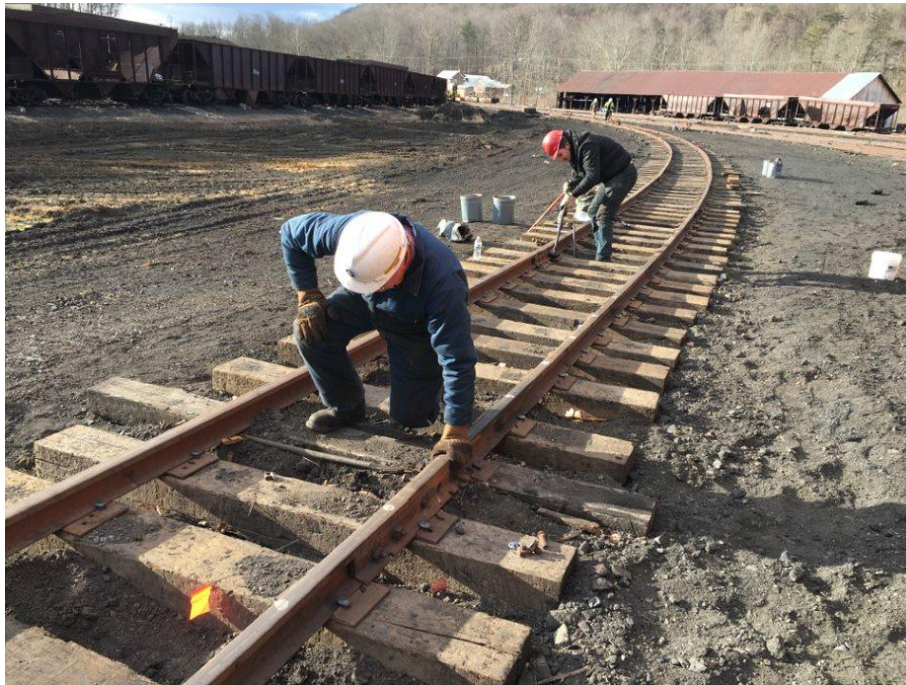
The FEBT Track Crew works on the south leg of the Rockhill wye in January 2021