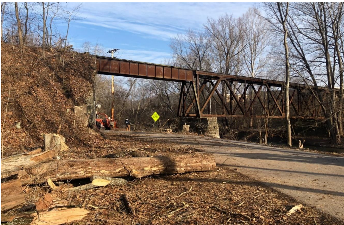
Pogue Bridge sits with cleared banks in January 2021.